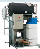
CVE Ready-for-use installation of all necessary supply components for the steam generator Also: Water-softening equipment and desalination heat exchangers