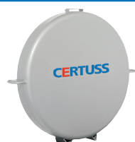
PARCOVAP® Condensate heat recovery