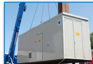
HEATING CONTAINER Fully equipped and ready for operation